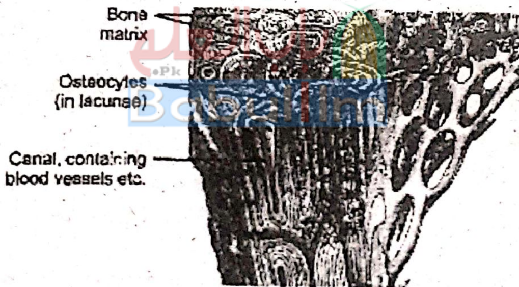
Fig. The internal structure of bone.

Like cartilage, the matrix of bones also contains collagen. But it also contains minerals e.g., calcium and phosphate. Cartilage contains a single type of cell. On the other hand, bones contain different types of cell. The mature bone cells are called osteocytes.